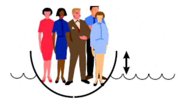
FIGURE 2. The technical contradiction in the lifeboat. As you add more people (weight) you get less freeboard (the distance from the gunwale of the boat to the water, shown by the arrow) This contradiction leads us to principles 15, 8, 29, and 34, all of which can be used to develop very plausible solutions using the available resources in the short time that the Titanic's crew and passengers had available.

This is a reduction in length of a moving object, in terms of the contradiction matrix.