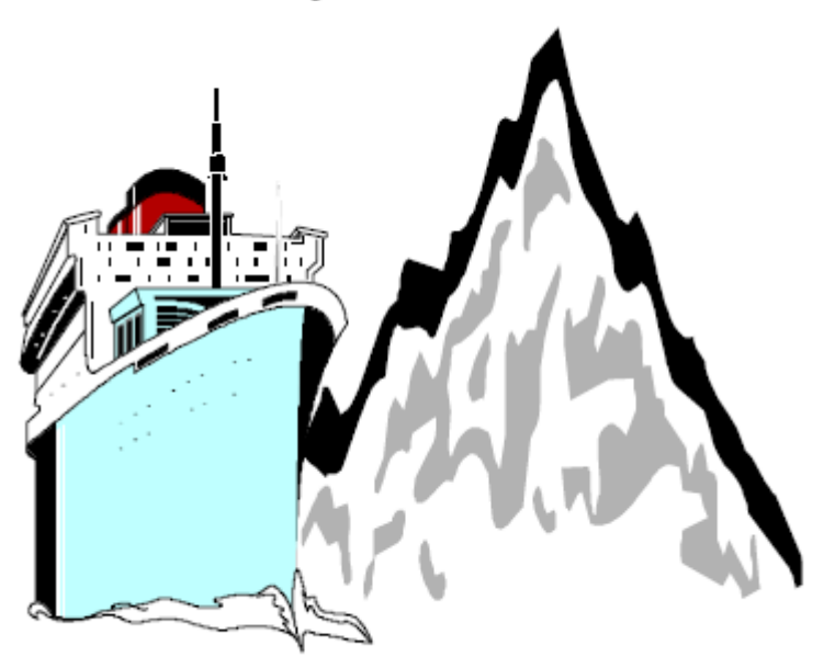
FIGURE 1. The initial conditions of the problem.

Published in the Proceedings of the 2nd Altshuller Institute Conference, May, 2000.